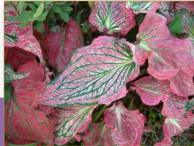
Caladium 'Pink Symphony'