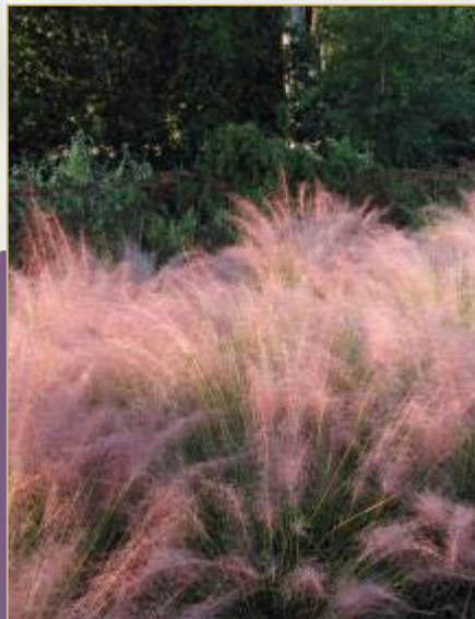
Muhlenbergia capillaris Muhly grass