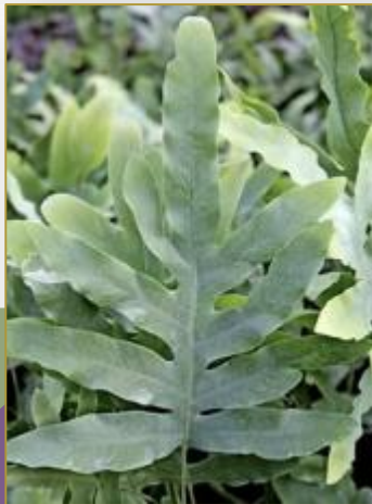
Phlebodium aureum 'Blue Star'