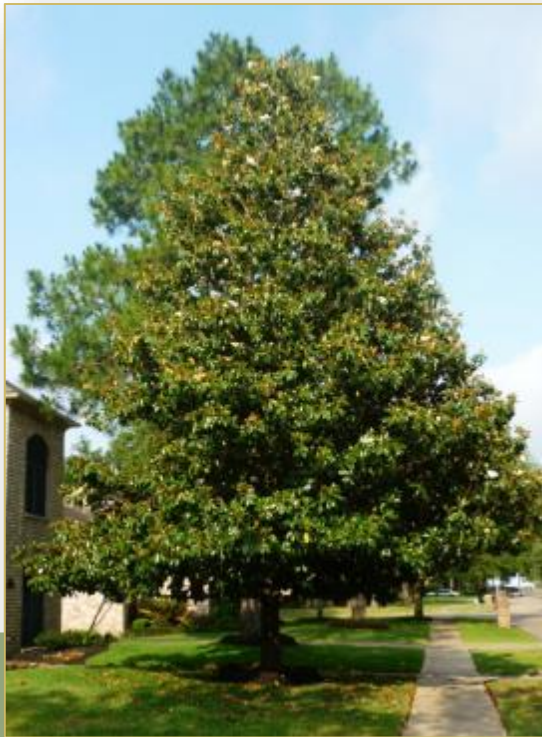
Magnolia grandiflora Southern Magnolia