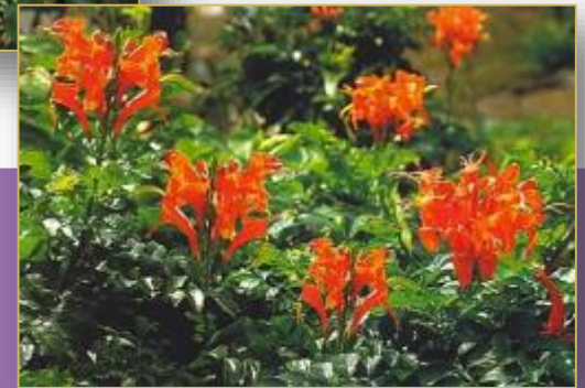
Tecomaria capensis Cape Honeysuckle