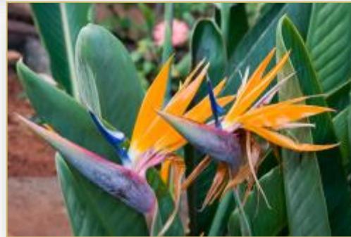
Strelitzia reginae Dwarf Bird of Paradise