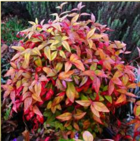
Nandina domestica 'Firepower'