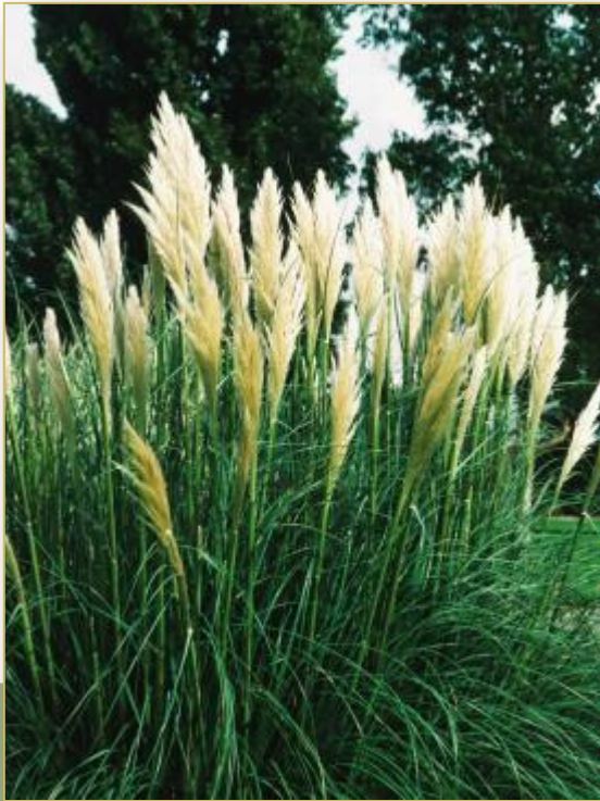
Cortaderia selloana Pampas grass