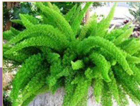
Asparagus densiflorus var. meyersii