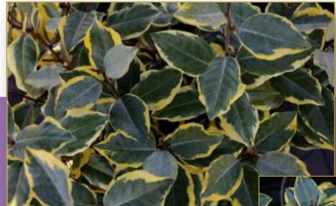
Elaeagnus x ebbengii 'Olive Martini'