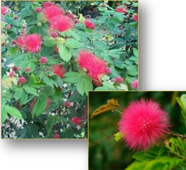
Calliandra haematocephala 'Nana' Dwarf Powderpuff