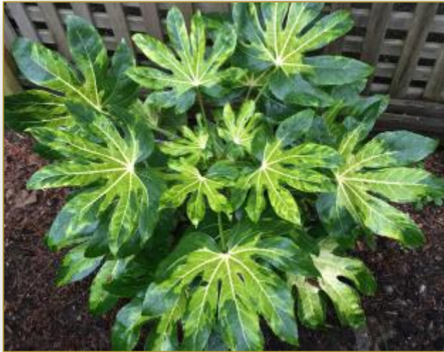
Fatsia japonica 'Camouflage'