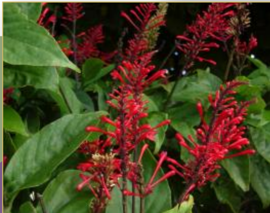
Odontonema strictum Red Firespike