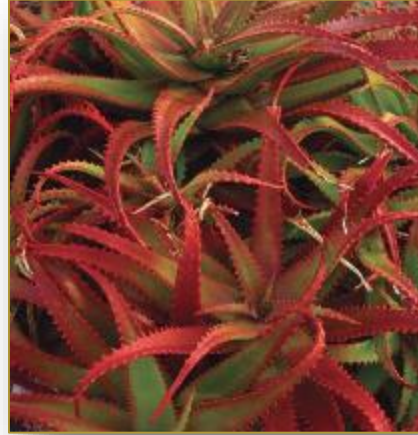
Aloe cameronii Red Aloe