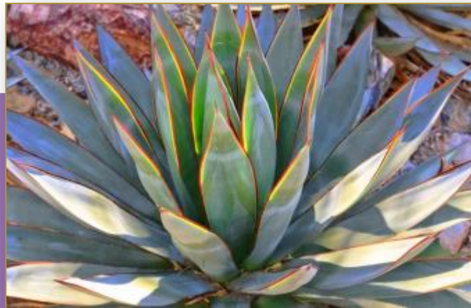
Agave 'Blue Glow'