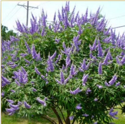
Vitex agnus-castus Chaste tree