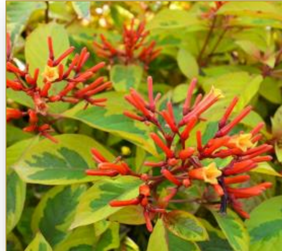
Hamelia patens 'Lime Sizzler'