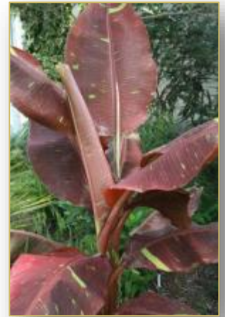
Musa spp 'Siam Ruby'