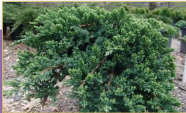
Juniperus procumbens 'Nana'