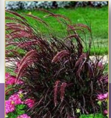
Pennisetum setaceum 'Rubrum' Purple Fountain Grass