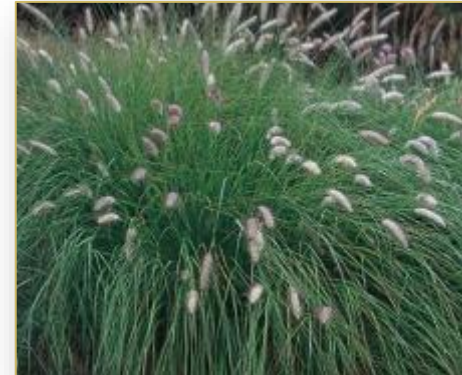
Pennisetum setaceum White Fountaingrass