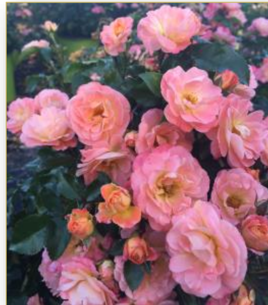
Rosa 'Peach Drift'