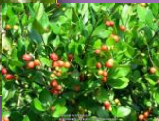
Myrcianthes fragrans Simpson's Stopper