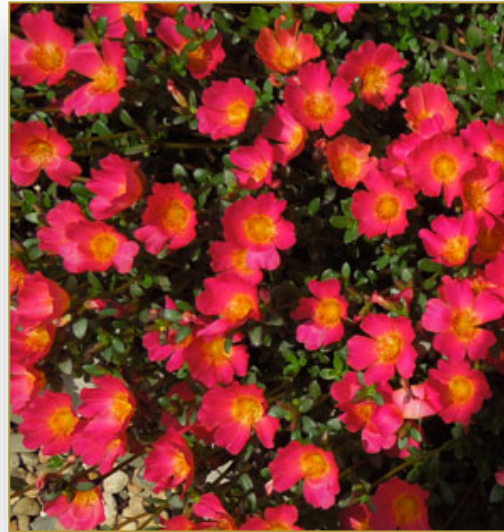
Cupcake Cherry Baby