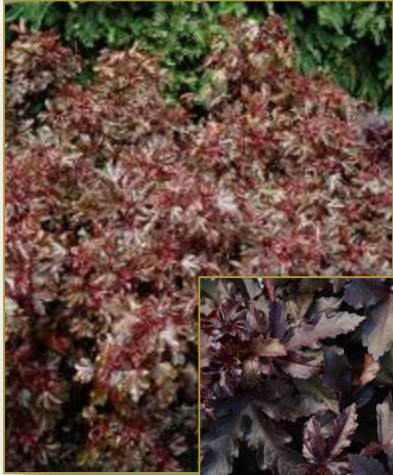
Hibiscus acetosella 'Little Zin'