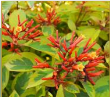
Hamelia patens 'Lime Sizzler'