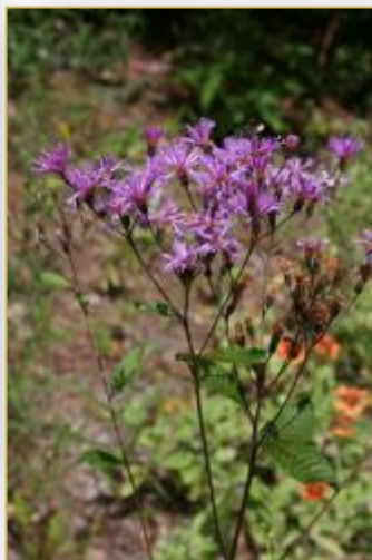
Vernonia gigantea Giant Ironweed