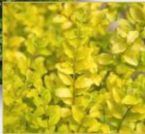
Ligustrum sinense 'Sunshine'