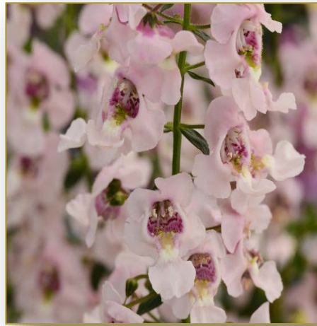
NEW Light Pink