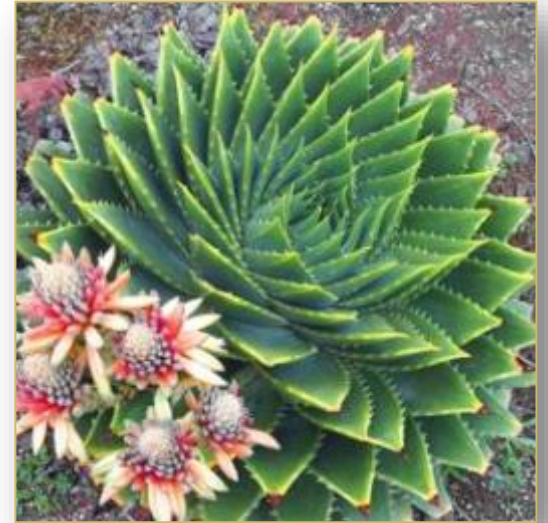
Aloe polyphylla Spiral Aloe