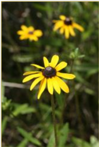
Rudbeckia hirta Black eyed Susan