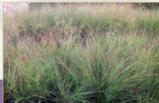
Eragrostis elliotti Elliotts Love Grass