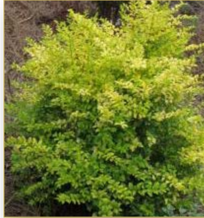
Ligustrum sinense 'Sunshine'