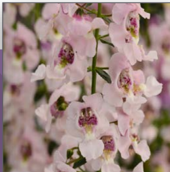
Archangel™ Series Angelonia