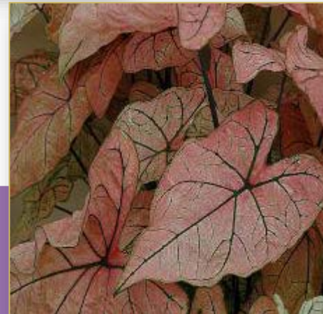
Caladium 'Spring Fling'