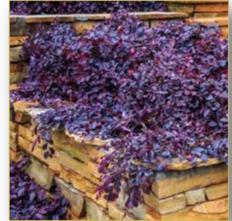
Loropetalum chinense 'Purple Pixie'