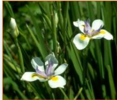
Dietes iridioides 'African Iris'