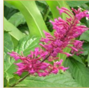
Odontonema callistachyum Purple Firepike