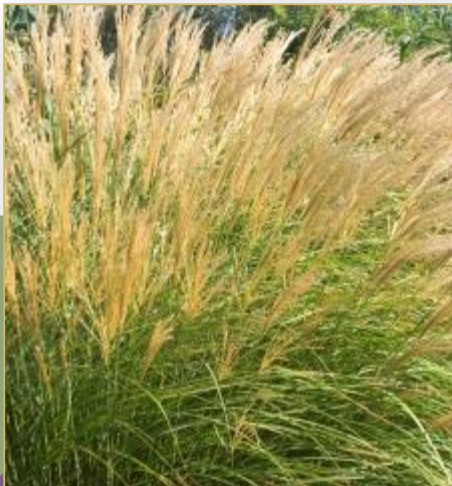
Miscanthus sinensis 'Adagio'