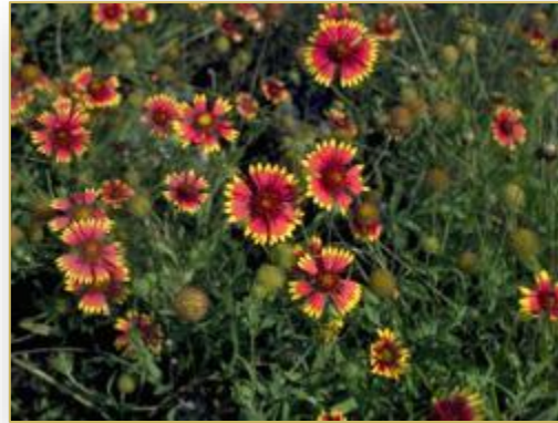
Gaillardia pulchella Blanket Flower