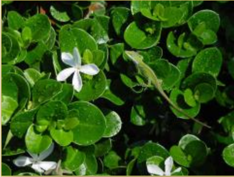
Carissa macrocarpa 'Boxwood Beauty'