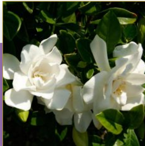
Gardenia jasminoides 'Radicans'