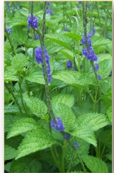
Stachytarpheta jamaicensis Blue Porterweed