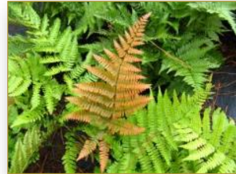
Dryopteris erythrosora Autumn Fern