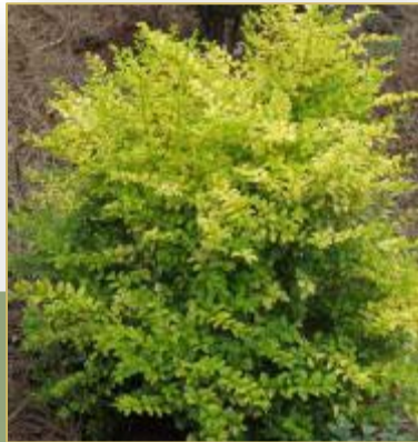
Ligustrum sinense 'Sunshine'