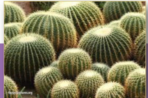
Echinocactus grusonii Golden Barrel Cactus