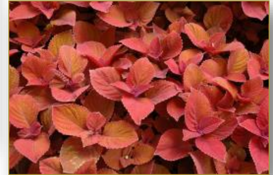
Solenostemon scutellarioides 'Campfire' coleus