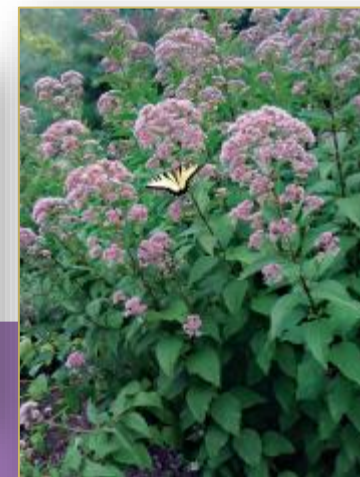
Eupatorium fistulosum Joe-Pye Weed