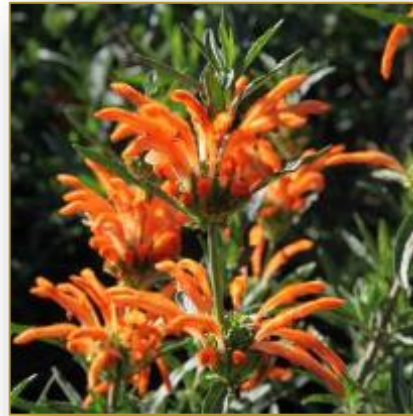
Leonotis leonurus Lion's Tail