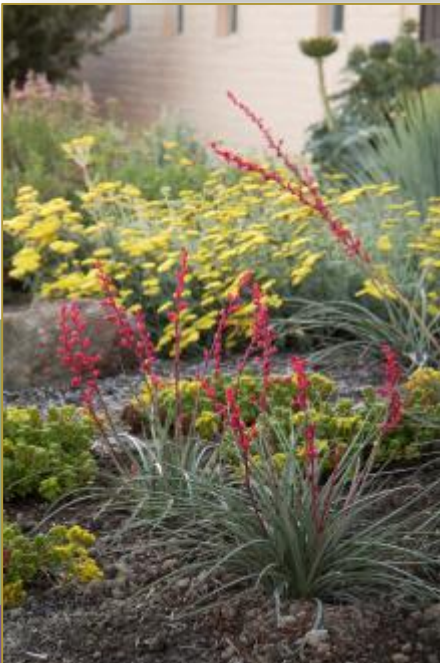
Hesperaloe parviflora 'Perpa' Brakelights Red Yucca