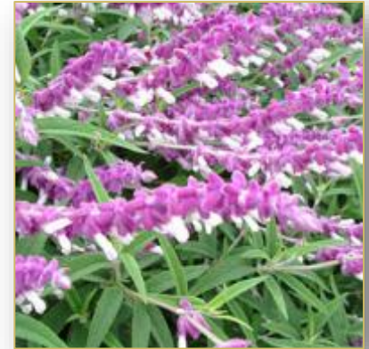
Salvia leucantha Mexican Bush Sage