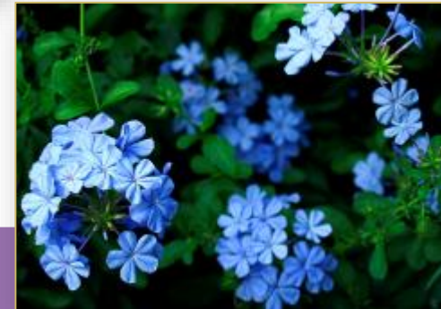
Plumbago auriculata Blue Plumbago