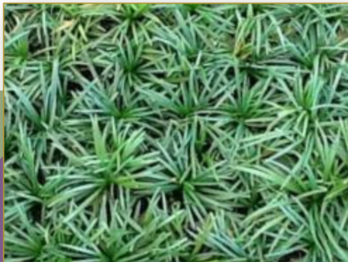
Ophiopogon japonicus 'Nana' Dwarf Mondo