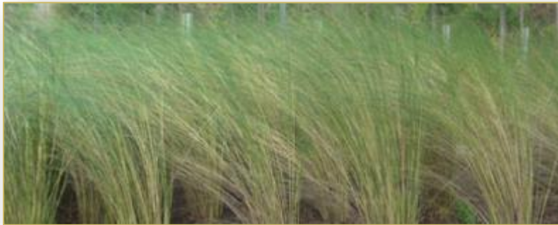
Spartina bakeri Sand Cordgrass