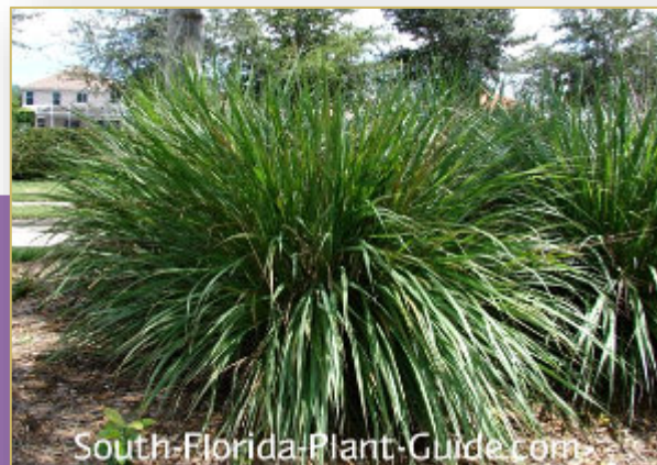
Tripacum floridana Dwarf Fakahatchee grass