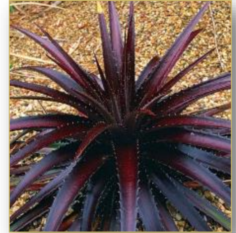
Dyckia fosteriana 'Cherry Cola'